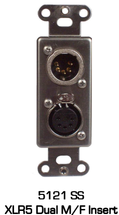
5121 SS XLR5 Dual M/F Insert