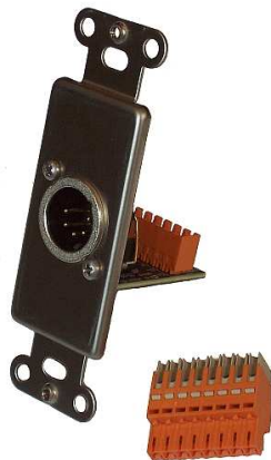
5201SS XLR5M to IDC