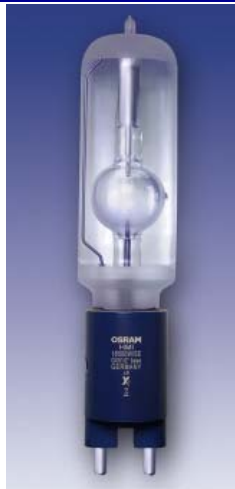
New version: Product No. 54324