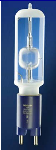
Old version: Product No. 54289