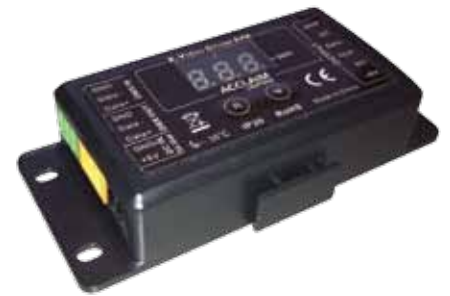
Flex Pixel Driver ( FLE768 )