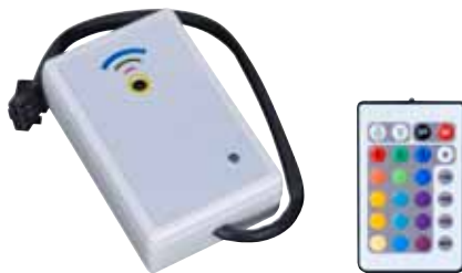
Flex Pixel IR ( FLE755 )