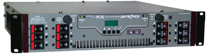
RD122 Rack Mount Dimmer

The RD122 is a 28,800 Watt, 12 channel, rack mount lighting dimmer. It is suitable for church, stage, theater, school, night club, live performances and other event and artistic applications. Each of the channels has a capacity of 2400 Watts. It is controlled via low voltage signals which may be LMX-128 (3 wire multiplex), or USITT DMX- 512. The unit is fan cooled. Channels may be independently assigned from the unit. The unit is over temperature and over voltage protected and has a magnetic circuit breaker for each channel. The RD122 has several stand alone functions which enable it to operate without a control console. These functions include a storable scene which may be activated by an external switch closure, a programmable chaser, and 7 factory set chase patterns.