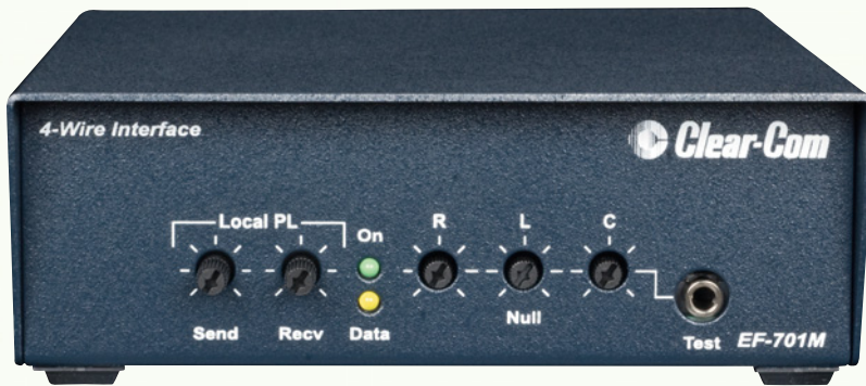
EF-701M Front Panel

The EF-701M interface converts a single channel of standard or TW party line intercom to four-wire audio, while also converting call signals to RS-422 data (and back). The resulting four-wire audio plus RS-422 data can then be sent to a Clear-Com Matrix port, fiber-optic converter (modem) or connected to another EF-701M over twisted-pair cable such as CAT-5E. When used with a Matrix system, the EF-701M allows a party-line channel to be connected to the frame with up to 5000' of cable. With its excellent hybrid null and wide-range level controls the unit may also be used as a best-quality stand-alone two-to-four-wire converter.