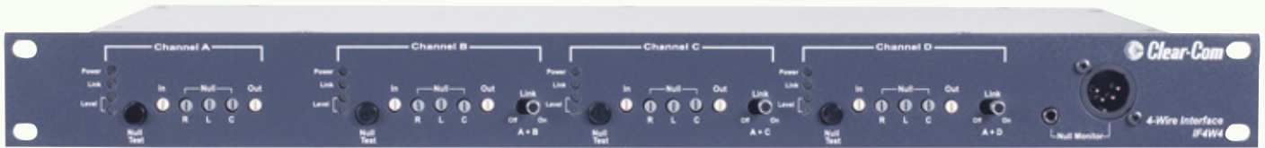
IF4W4 front view

The IF4W4 modular 4-wire interface connects camera intercoms, two-way radios, fiber optics, and other 4-wire devices to a standard Clear-Com intercom line. The 1-RU chassis holds up to four individual interface modules, each with its own 4-wire terminal block and XLR-3M connector to interface with Clear-Com.