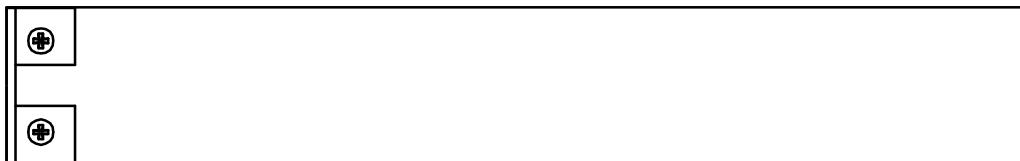
model DMX96ANL SIDE with optional RACK KIT