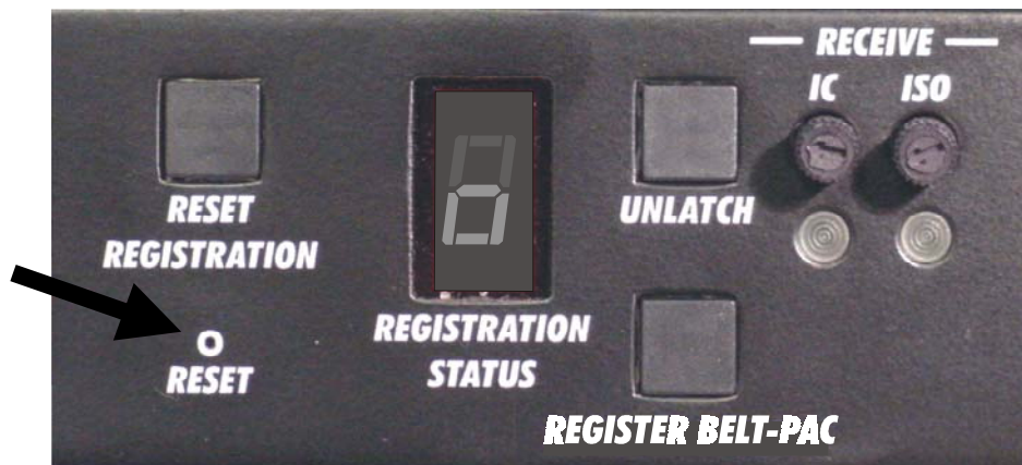
Figure 1. Registration buttons and indicator on left front panel of base station

NOTE: To press the RESET button, insert a small paper clip or similar object into the RESET hole.