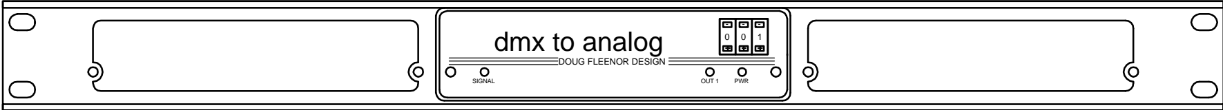
model DMX24ANL FRONT with optional RACK KIT RKT1-3