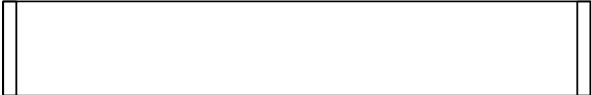
model DMX24ANL SIDE