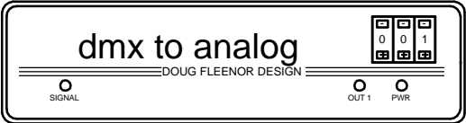
model DMX24ANL FRONT